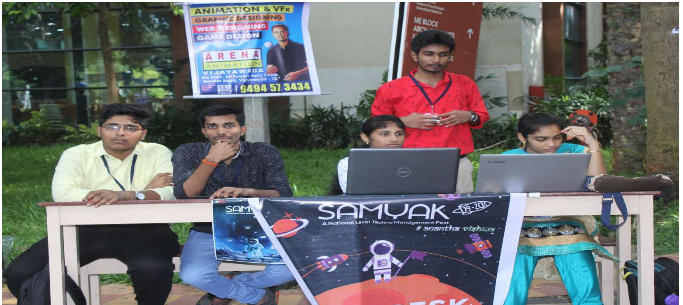
Participation of Students in 18.10.2019