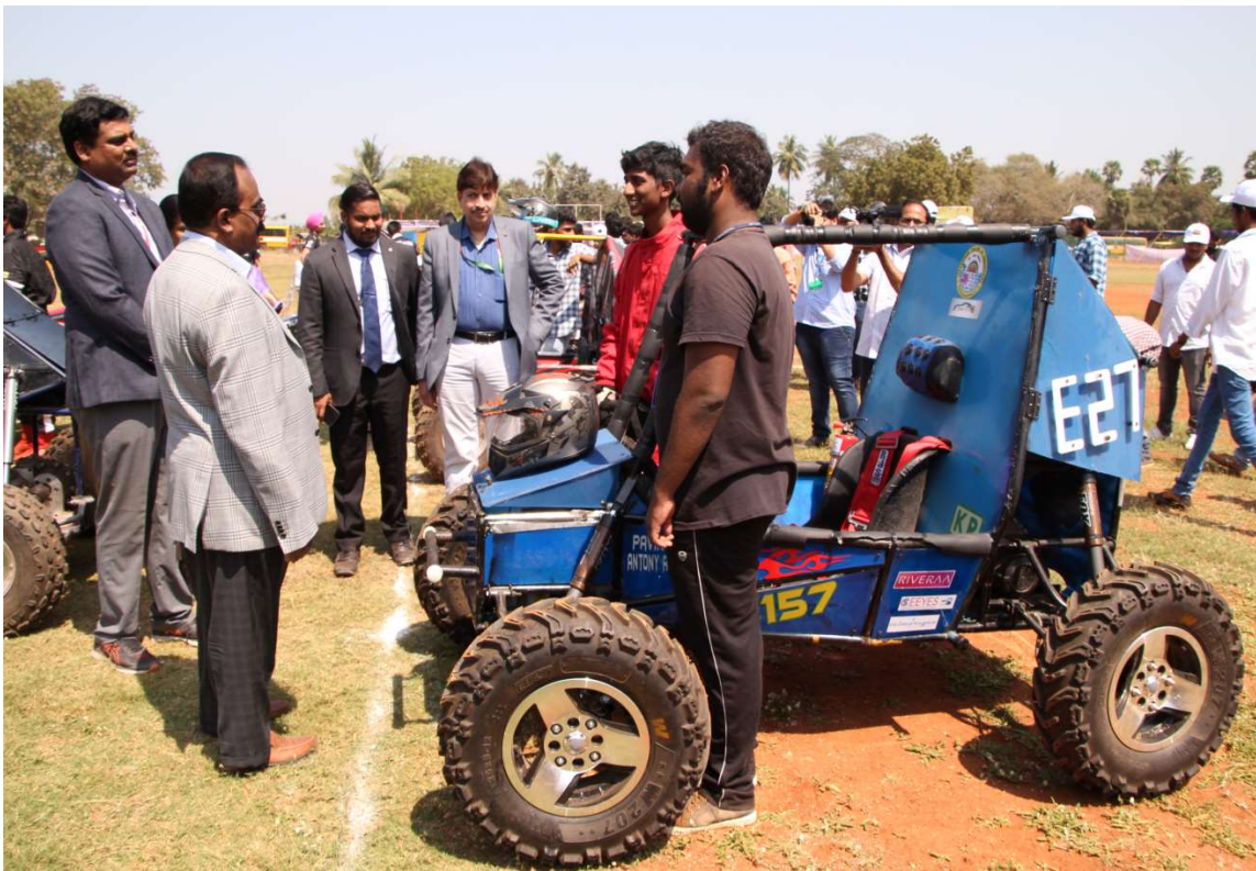
Participation of Students in Technical events on 18.10.2019